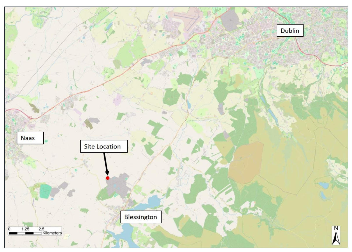
Figure 1-1 - Regional Site location.